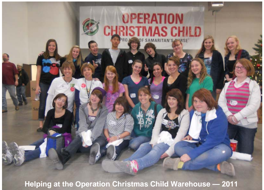
Helping at the Operation Christmas Child Warehouse — 2011

A Family is a Place of Conversation Ephesians 4:25-5:2